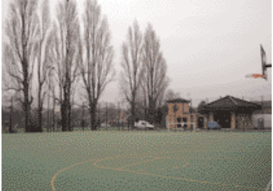
Kilburn, West Hampstead, Swiss Cottage and Primrose Hill